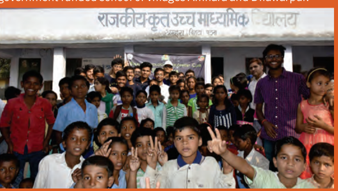
(IITP Students with Primary School Students at Amahara Village,

Rural Technology Development Club (RTDC) is the student club of Indian Institute of Technology Patna that aims to identify the problems prevailing in the rural areas and work to develop technologies and devices to address them. They work to foster an ideas into the routine activities and develop technologies to scale up the efficiency of the traditional manufacturing processes followed in rural areas. Under project Adhyayan of RTDC, student members of the club visit the local government funded schools and teach the students of classes 9 and 10 everyday all round the year. The schools students are taught concepts of Mathematics and Science regularly and also prepared for their Bihar School Examination Board class 10 exams. This noble initiative runs free of cost by entirely by the club. RTDC organises Adhyayan Utsav, the cultural annual festival for rural students, every year in the government funded school of villages Amhara and Dilawarpur.