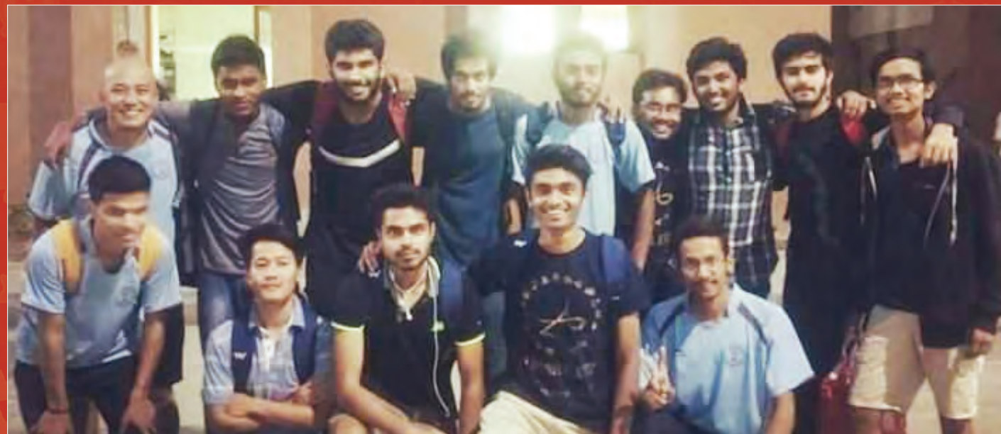
Winning Football Team Members, AIIMS Tournament, 2017