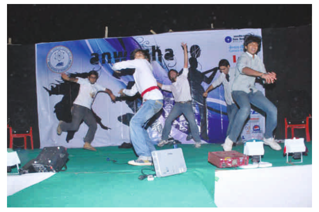
The Spirited Students of IITP