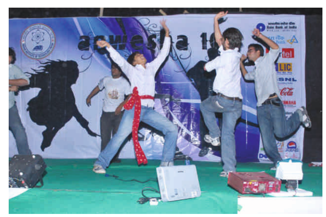
Festive Mood at IITP