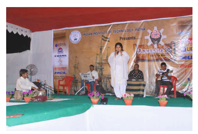
Cultural Evening with artists from All India Radio, Patna

It was the first ever technical competition to be held in IIT Patna, the Science and Technology Council of IIT Patna was responsible for the smooth conduction of this event. This event has witnessed participation from both the firs years and the second years alike. The challenge was to create the circuit using the minimum number of circuit elements within the prescribed time of 3 hrs. The word Alegra is Spanish for welcome. The winning team was 'The Black Boxes' who had made it past the tough competition offered by the other participating teams.