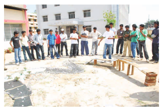
Students Outside the Mechanical Engineering Lab