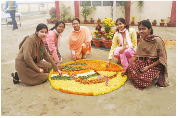
Creative Students Braving the chill on Republic Day