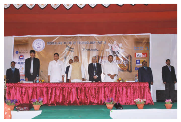
Hon'ble CM and other dignitaries at the Central Stage