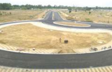
Road with street light post at roundabout portion in front of Administrative Building