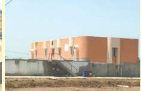
Water Treatment Plant