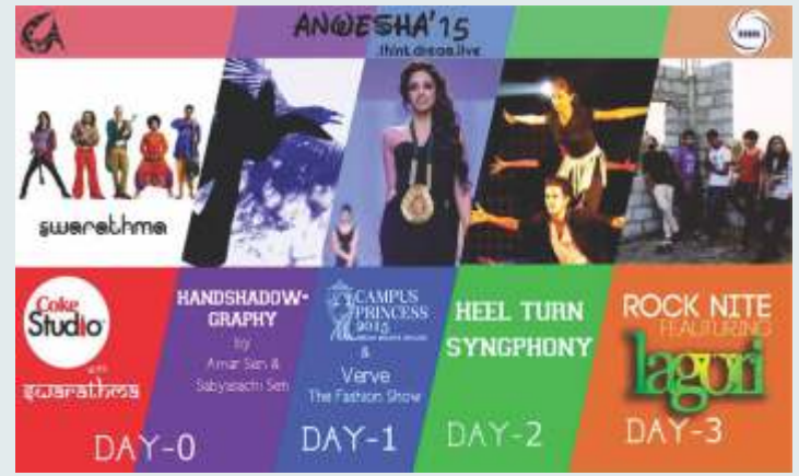
Highlights of Anwesha'15 (29<sup>th</sup> January 2015 – 1<sup>st</sup> February 2015)

IIT Patna is incomplete without Anwesha , the Techno-Cultural Festival of IIT Patna. The 6th edition of Anwesha took place from 29th Jan to 1st of Feb 2015 and saw a huge crowd and participation from colleges all over India. These 4 days echoed the theme of the festival "Hakuna Matata" meaning "No Worries". The first night witnessed the opening ceremony and a performance by the Sufi fusion band of Coke Studio – Swarathma. The pronites of Day 1 featured the much awaited Femina Miss India Campus Princess and Verve – The Fashion Show , judged by Miss India Earth 2013 Miss Shobita Dhulipala. Day 2 began with a lot of excitement and aggressive competition as teams clashed in guizzes and on spot events. But this was all bland