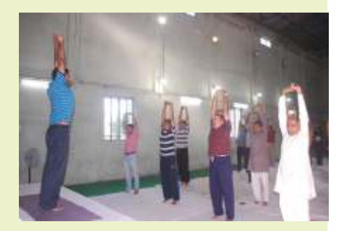
Participants in the Yoga session