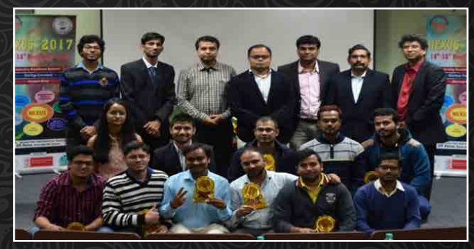
Alumni meet as part of NEXUS IITP 2017